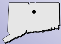
Hartford area, Connecticut